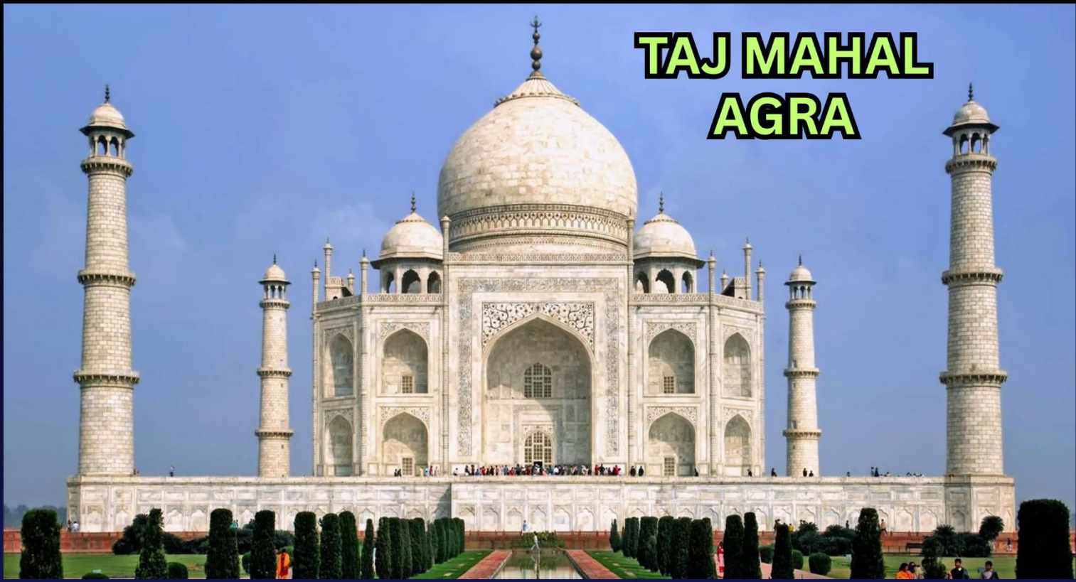
TAJ MAHAL AGRA